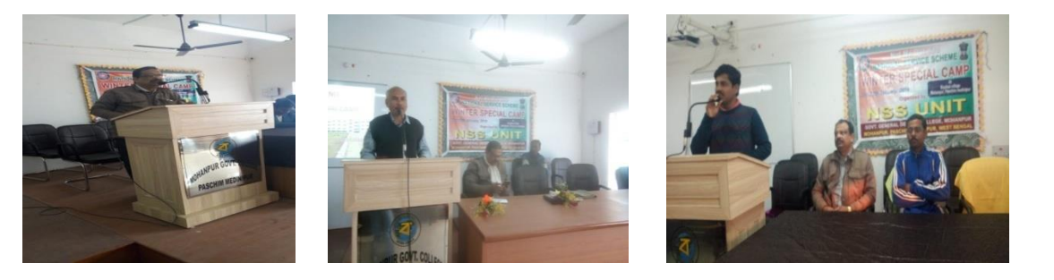
Figure 2: Speech of OIC, Chief Guest & P.O.