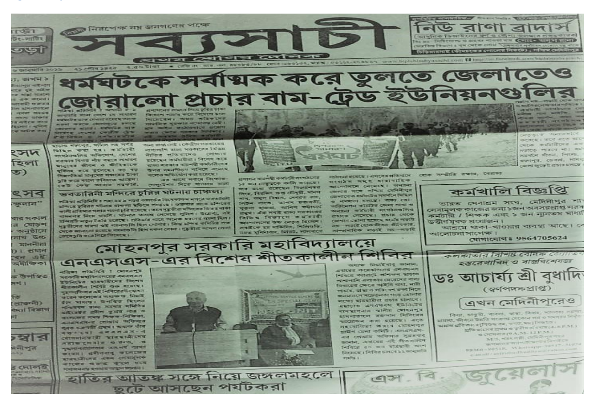
Figure 3: News Paper Reporting of the Opening Ceremony.