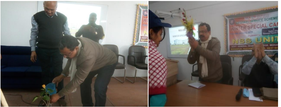
Figure 1: Planting new sapling by OIC